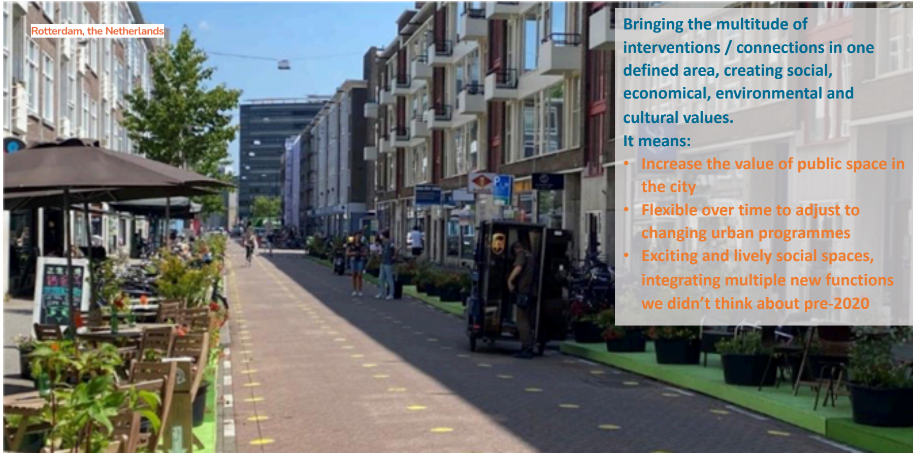
Rotterdam, the Netherlands

Bringing the multitude of interventions / connections in one defined area, creating social, economical, environmental and cultural values.