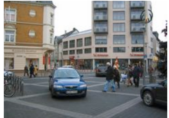
Gegenseitige Rücksichtnahme funktioniert

Shared Space Eine neue Gestaltungsphilosophie für Innenstädte? J. Gerlach a. all, Unfallforschung GDV 2009