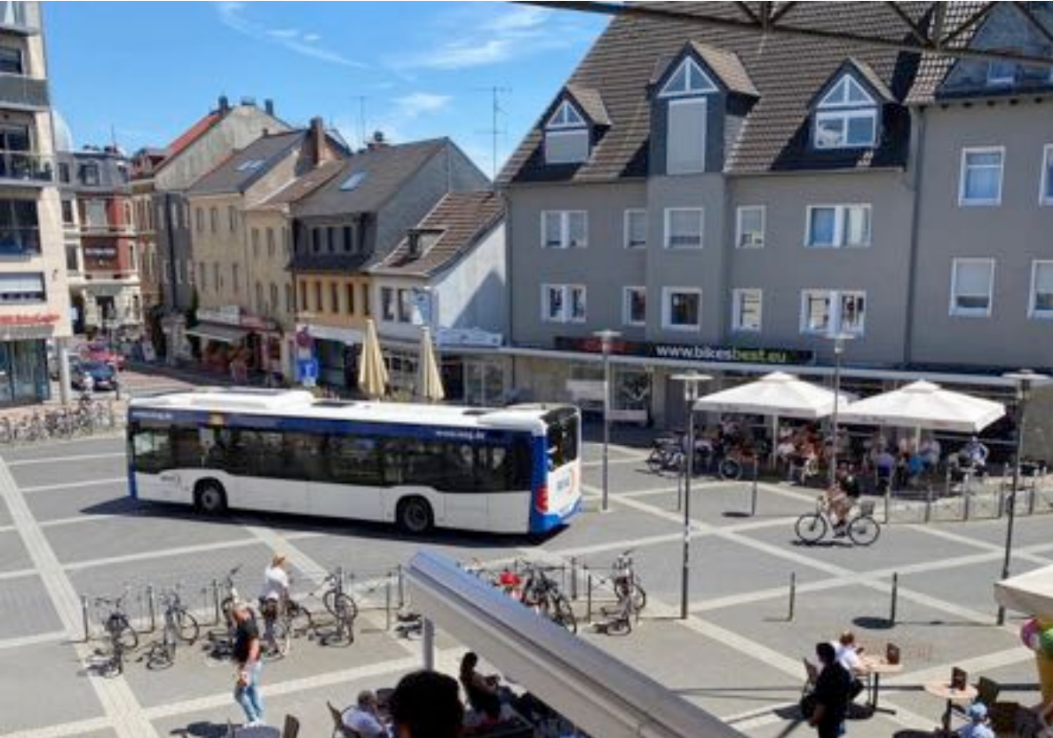
Brühl – der „Stern“