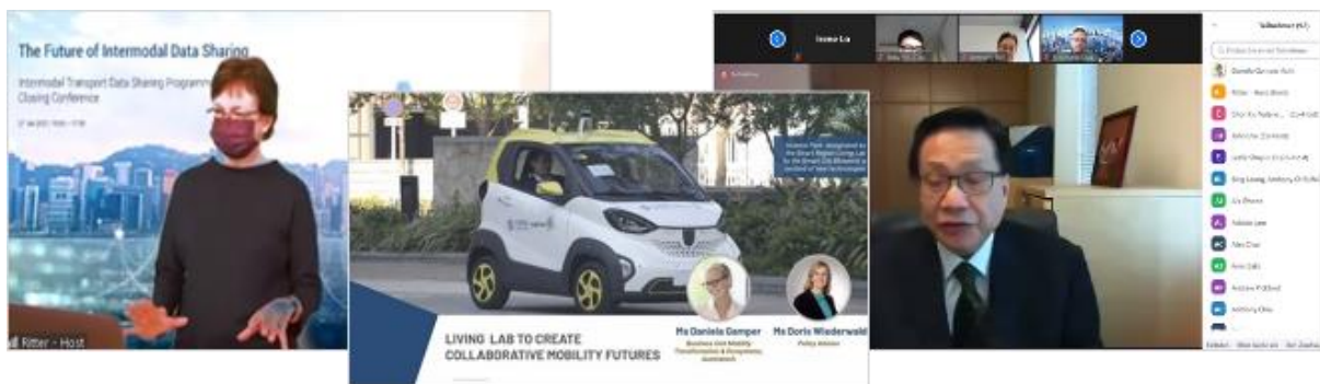
Figure 2 Smart Mobility Conference Hong Kong

In June 2021, the 4 th PSG (Project Steering Group) meeting took place. Due to the COV19 situation, the PSG meeting took again place as virtual meeting.