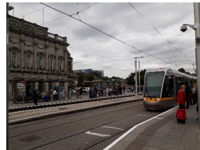
Luas Heuston Luas Stop