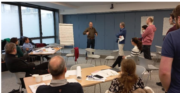
First written during the second workshop.